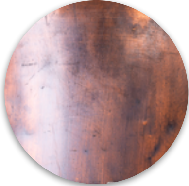
Ombra Blackened Copper.