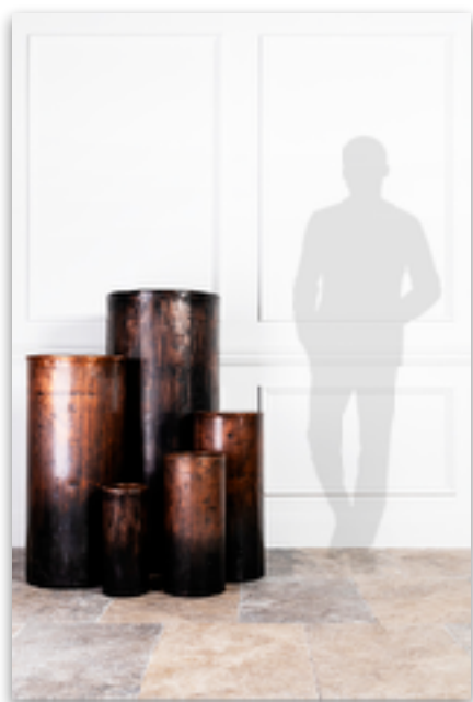
OMBRE BLACKENED COPPER

All imagery is available for free via the "Image Download" tab on each product profile. Simply visit: www.gatherco.com.au or free call: 1800 428 437 for further assistance.