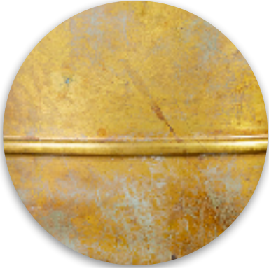
Ombre Blackened Brass