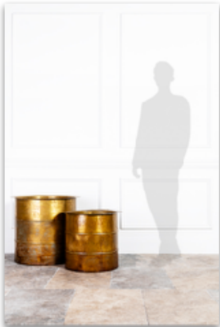
OMBRE BLACKENED BRASS