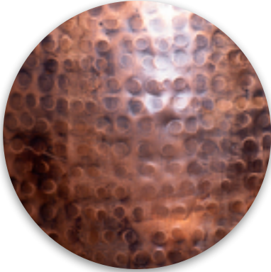
Hand Beaten Ombre Blackened Copper.