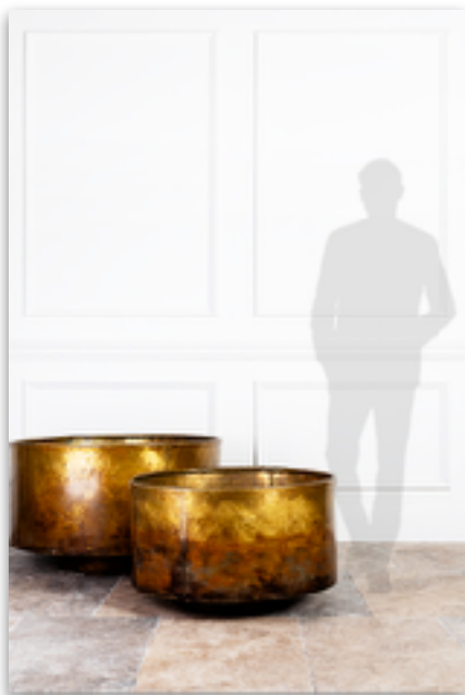
OMBRE BLACKENED BRASS

All imagery is available for free via the "Image Download" tab on each product profile. Simply visit: www.gatherco.com.au or free call: 1800 428 437 for further assistance.