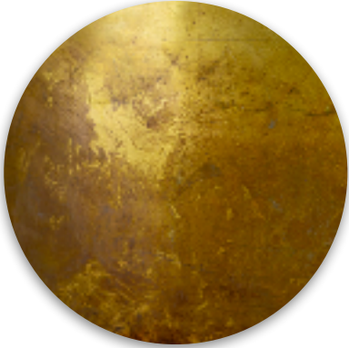
Ombre Blackened Brass