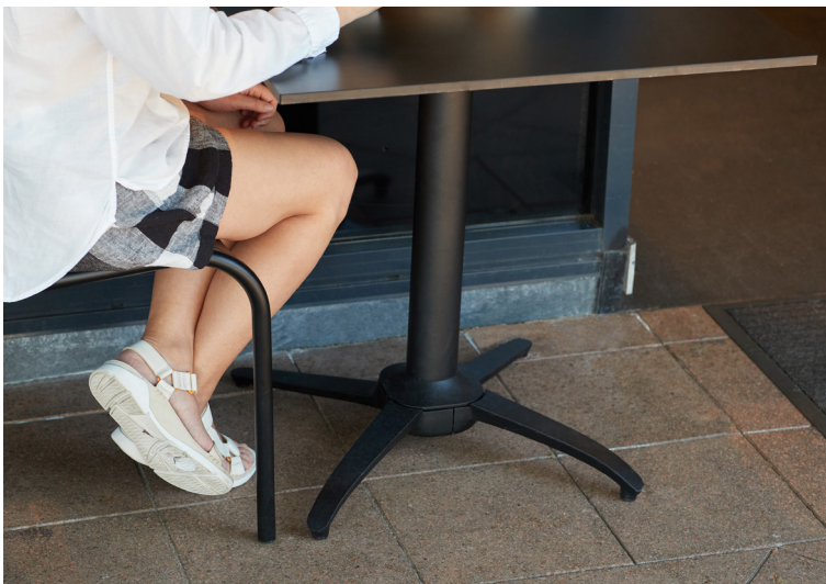
Charcoal Fish, Sydney, Australia